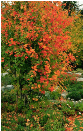
Bigtooth Maple ( Acer grandidentatum )

In order to better market the water wise plants available in many Utah nurseries and garden centers, and to assist consumers in identifying these plants, a program to recognize desirable low water use species has been developed. Representatives from Utah State University Extension, Utah State University Center for Water Efficient Landscaping, the Utah Nursery and Landscape Association, Utah Division of Water Resources, Utah Botanical Center, Jordan Valley Water Conservancy District, Red Butte Gardens, U.S. Bureau of Reclamation, Salt Lake City Corporation, Sandy City, and the Utah Native Plant Society have worked together to organize a water wise list of ornamental trees, shrubs, herbaceous perennials, ornamental grasses, and ground covers. The plants on the list are (1) water conserving, (2) adapted to Utah's arid climate and cold winters, (3) available in the industry, (4) relatively easy to maintain in the landscape and (5) have desirable landscape characteristics which remain desirable under limited